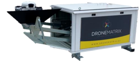
Drone Matrix YACOB